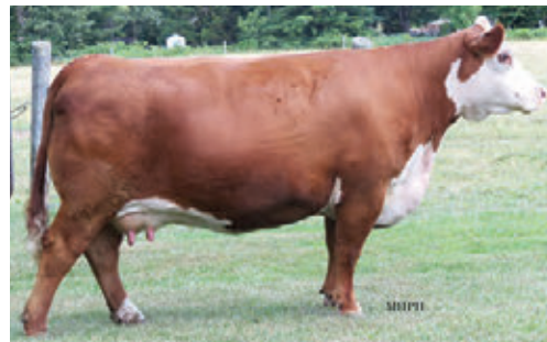
Dam of MHPH 1021K MHPH 301W Dainty 205Y