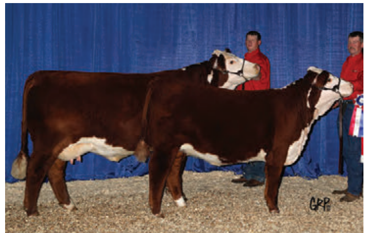
MHPH 160A NITA 110D AS A CALF

As in the previous year, pairs were the feature. High selling two-year-old pair sold for $52,800.00. MHPH 106A Nita 110D by MHPH 521X Action 106A and her mother, MHPH 10Y Nita 305B sired by NJW 73S W18 Hometown 10Y ET.