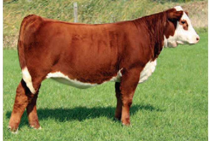
MHPH 415J 2021 High selling heifer calf to Blairs.Ag Cattle Co.