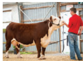
8404F - Maternal Sister

112K will be entered at the Royal and we would be happy to assist her new owner if they so chose.