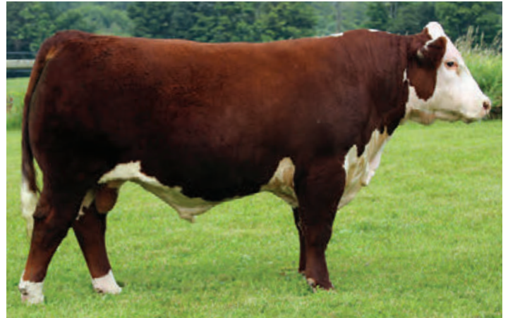
MHPH 117E HOBBS ET 203H