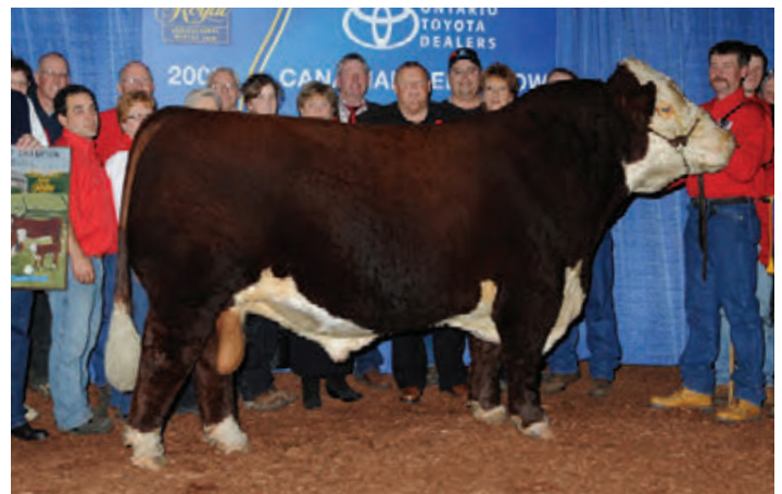
MHPH 13P Stetson 102S

Topping the sale was MHPH 13P Stetson 102S sired by Remitall Patriot ET 13P (a 3/4 brother to XXIV sale topper Heat) at $41,000.00 for 2/3 interest. CCL Holdings Ltd., Lloydminster, Saskatchewan and the Stetson group (Bethanie Farms, Chula Vista Polled Herefords, Sinnibar Stock Farms, Lian Mor Polled Herefords, Shorty Croft Polled Herefords, C&T Cattle Co., Marbren Farms, Thurston Livestock and Bonnie Brae Farm) purchased the bull. Stetson was Junior Champion Bull at the 2007 National at Canadian Western Agribition and was selected Canadian National Champion Bull at the Toronto Royal Winter Fair and subsequently earned the status of Gold Trophy Sire.