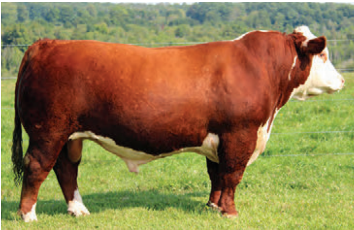
MHPH 646D GUNFIRE ET 401G

MHPH 646D Gunfire ET 401G topped the bulls, this son of Churchill Rock 646D ET brought $34,000.00 for a ½ interest from Sinnibar Stock Farm, Russell, Manitoba and the Gunfire Investment Group. This youngster was later named Junior Bull Calf Champion and Reserve Champion Bull at the 2019 Toronto Royal Winter Fair.