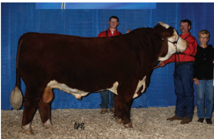
MHPH 102S WYATT 301W

MHPH 102S Wyatt 301W , a son of MHPH 13P Stetson 102S was selected by C&T Cattle Co., Arcola, Saskatchewan. That same fall, he was chosen Junior Bull Calf Champion at the Royal Winter Fair in Toronto. The following year he achieved Junior Champion Yearling Bull and in 2011 He captured Grand Champion Honors.