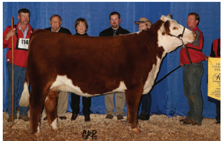
MHPH 521X DAINTY 105A

The high selling bred heifer, MHPH CLF 101S Sarah 121Z , a daughter of BNMHPH 13P Heat 101S , was selected by JWR Polled Herefords, Sunderland, Ontario for $11,000.00 for a ½ interest. The high selling heifer calf, MHPH 521X Dainty 105A by TH 122 711 Victor 521X ET was purchased by Ridgeview Polled Herefords Alto, Michigan. She went on to win her division at the Royal Winter Fair later that fall and returned the following year to capture the Grand Champion position. Autumn Alliance XXXII grossed $324,200.00 and averaged $5,800.00