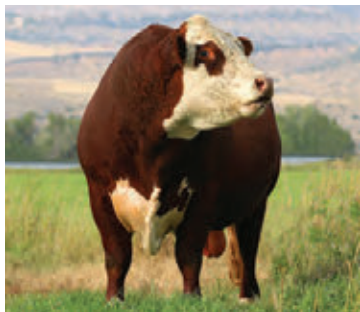
Sire of RW 208K Churchill Red Baron 8300F ET