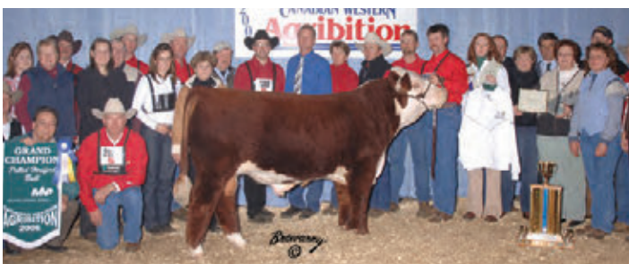
BNMHPH 13P HEAT 101S

"Heat" went on to Canadian Western Agribition where he was named Senior Bull Calf Champion and Canadian National Grand Champion Bull... the first to win as a calf.