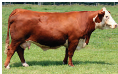
Dam of MHPH 1025K MHPH 5D Nita 1011F