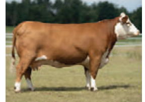
Hill's Lady Lark- Dam

Micki is a high quality female with a true maternal presence. Lady Lark, her dam knocks it out of the park every year putting that added length, hip and style into her calves. When you throw Remital Vortex into the mix and the maternal power behind him, Micki is destined to be a future donor.