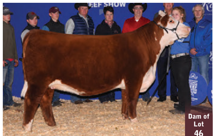
Dam of Lot 46

Potentially the first Fresh Prince heifer to sell in Canada, and she isn't even born yet. We had a lot of success with this Riesling x Fresh Prince flush and we are really excited to offer this Pregnancy.