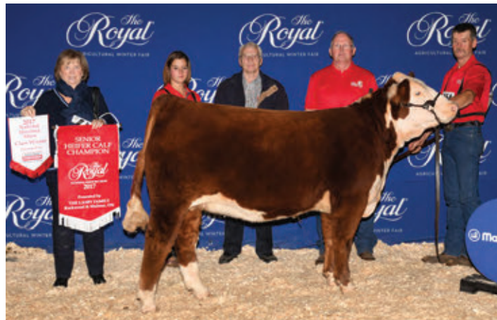
MHPH 3134 RYTHYM 1141E

The cow/calf pair, MHPH 3134 Rythym 1141E sired by Churchill Stud 3134A was selected by Chula Vista Polled Herefords, Thornton, Ontario and Lian Mor Polled Herefords, Mono, Ontario and the mother, Haroldson's WLC Rhythm 12Z 16B sired by Haroldson's Liner 521X 12Z was purchased by Wascana Cattle Co., Regina, Saskatchewan and brought $34,000.00. Later in November of that year, MHPH 3134 Rythym 12Z 16B, was named National Senior Heifer Calf Champion.