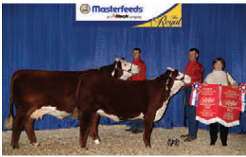
Dam & Grand Dam of MHPH 114K MHPH 106A Nita 110D & MHPH 10Y Nita 305B