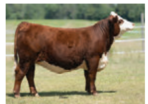
Bandit - Maternal Sister