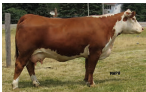
Dam of MHPH 2121K PCL Fiesta 106A 36C