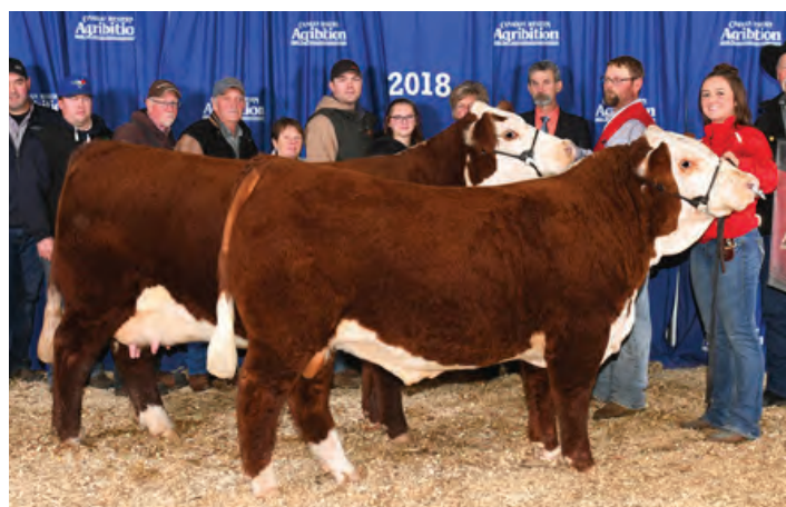
RVP 106A CAMEO GIRL 45C

The second Champion Female of the World to come through the ring was RVP 106A Cameo Girl 45C, a daughter of MHPH 521X Action 106A , was purchased by Glenlees Farm, Arcola, Saskatchewan for $11,000.00. She went on to win Bonanza 2018 and then crowned Canadian National Champion Female at Canadian Western Agribition.