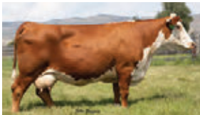
CL 1 Dominette 055X - Grand Dam

CRR ABOUT TIME 743 (DLF HYF IEF MDF) STONEWOOD ROSE 8X NDR KARONA'S LAD 3N NUHOPE 73L LITTLE GIRL 57P