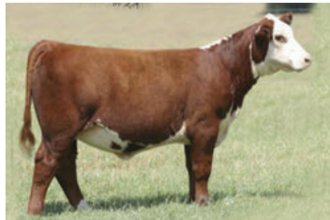
Dam of RW 208K 6MC T/R 561C Shelby 013 ET