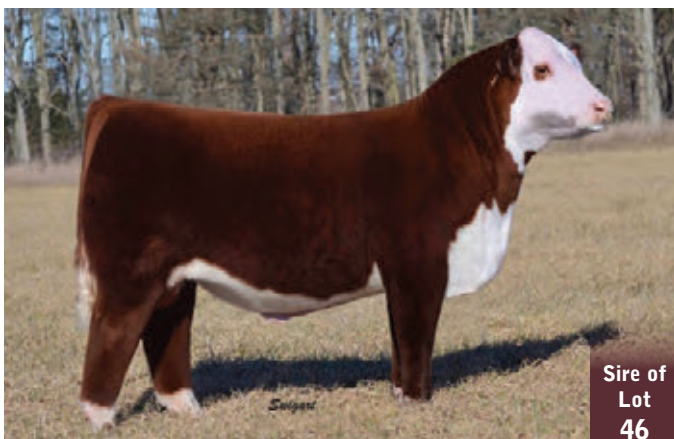
Sire of Lot 46