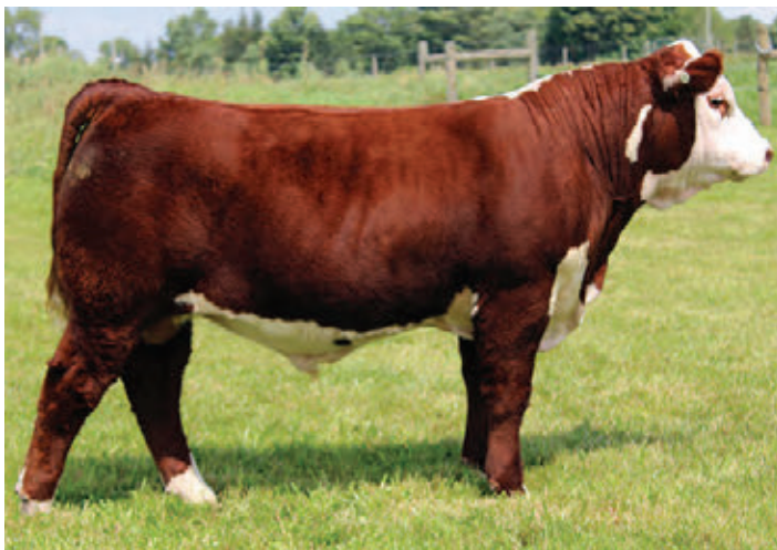
KJ MHPH RW 364C MEDIA 240J ET

High selling bull, KJ MHPH RW 364C Media 240J ET sired by Loewen Genesis G16 ET brings $240,000.00 for a ¼ interest. He was purchased by Abby Hills Farms, Richmond, Ontario, Tennessee River Music, Fort Payne, Alabama and the Media group. Media was selected Senior Bull Calf Champion at the Canadian National Hereford Show at the 50th Anniversary of Canadian Western Agribition in Regina, Saskatchewan.