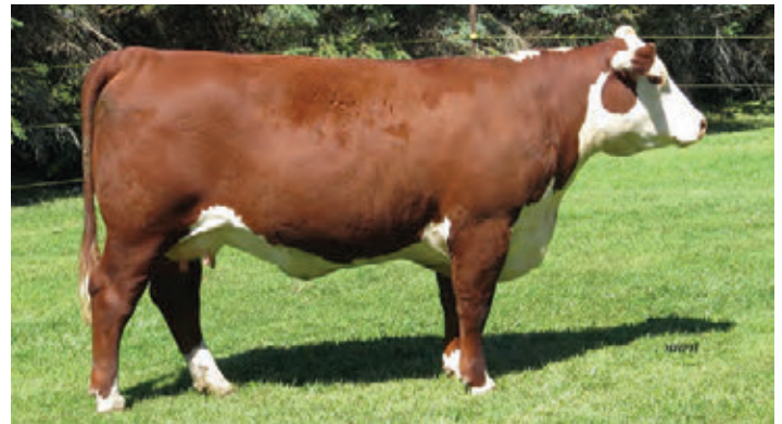
RVP 51X ABLAZE 7A

The second high selling pair fetched $18,500.00 with MHPH 106A Radiance 103C sired by MHPH 521X Action 106A being selected by River Valley Polled Herefords and RVP 51X Ablaze 7A by RVP 6056 Xcalibur 51X purchased by RSK Farms, Brandon, Manitoba and Harvie Ranching, Olds, Alberta. Successfully campaigned by RSK and Harvie Ranching, RVP 51X Ablaze 7A achieved the status of World Grand Champion