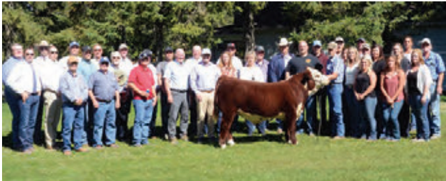
240J 2021 High selling bull calf to Abbey Hill Farms, Tennessee River Music and The Media Group