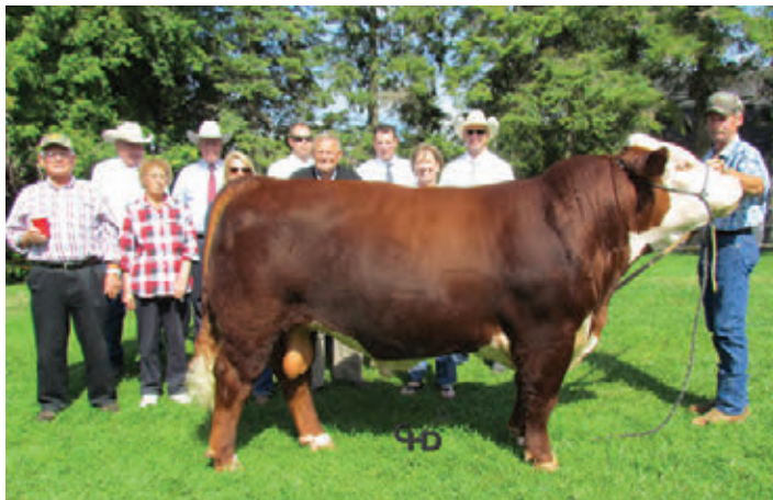
MHPH 10Y CHIZEL ET 1021C

High selling bull, MHPH 10Y Chizel ET 1021C sired by NJW 73S W18 Hometown 01Y ET at $17,000.00 for a ½ interest was purchased by Bar-J-M Polled Herefords, Whitney, Ontario. That fall he garnered Reserve Junior Champion Bull status at the Royal in Toronto and Canadian National Reserve Senior Champion Bull in 2017.