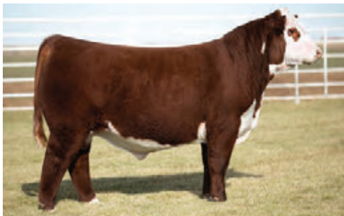
Sire of MHPH 1021K Loewen Genesis G16 ET