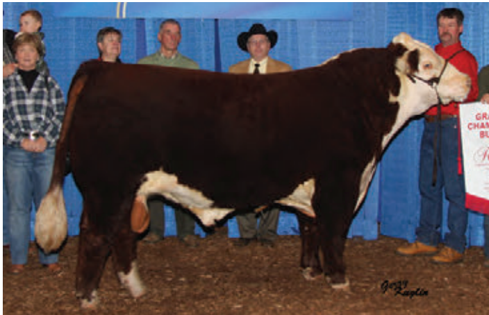
BNMHPH 101S UMPIRE 118U

In Autumn Alliance XXVII the second high selling bull was MHPH 101S Umpire 118U , a son of BNMHPH 13P Heat 101S . An interest was purchased by Moorehaven Farms, Acton, Ontario for $7000.00. Later that fall he was shown with his mother at the Royal Winter Fair where the pair captured Canadian National Champion Female. Umpire as a two-year-old head lined Autumn Alliance XXVII where he was selected by Phantom Creek Livestock Ltd., Swift Current, Saskatchewan and Genex Co-operative Ltd., Rockwood, Ontario. Later that fall, Umpire was declared Canadian National Grand Champion Bull at Canadian Western Agribition in Regina, Saskatchewan and is a Silver Trophy Sire.