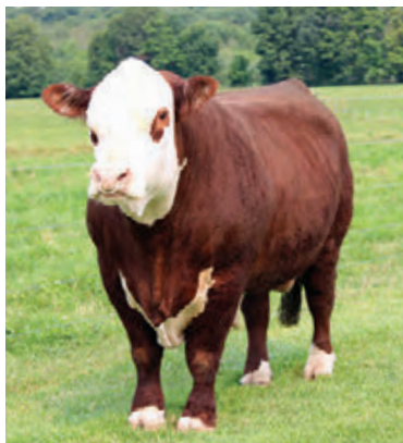
Sire of MHPH 219K Remitall-W Vortex 84G