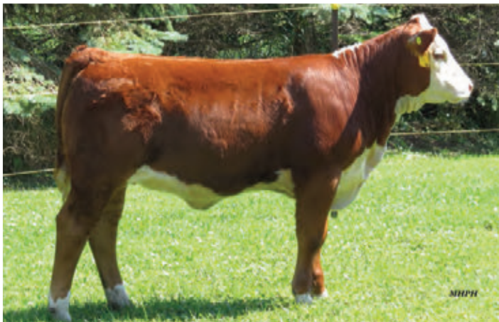
MHPH 16A TORI 211C

Two-year-olds with their calves at side were a feature of this sale. The high selling pair in the 2015 event at $43,500.00 were MHPH 16A Tori 211C by MHPH 521X Action 106A purchased by Tori Investors Group, Baysville, Ontario and her mother, PCL Tori 118U 41A sired by MHPH 101S Umpire 118U was selected by Lone Pine Cattle Services, Vibank, Saskatchewan.