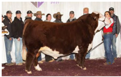
Sire of MHPH 114K Haroldson's United 33D 36G