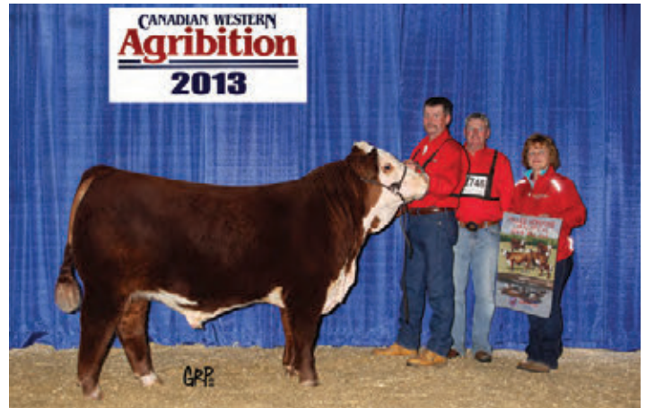
MHPH 521X ACTION 106A

Autumn Alliance XXXI – grossed $262,800.00 and averaged $5,475.00. High selling bull was MHPH 521X Action 106A sired by TH 122 711 Victor 521X ET bringing $47,000.00 for ½ interest and purchased by Double J Polled Herefords, Maidstone, Saskatchewan. Later that fall, Action captured Senior Bull Calf Championships at the Royal Winter Fair and Canadian Western Agribition and concluded the year by being selected as Reserve National Champion Bull.