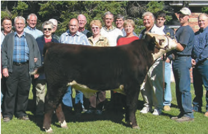
MHCVB 68M PROWLER 118P