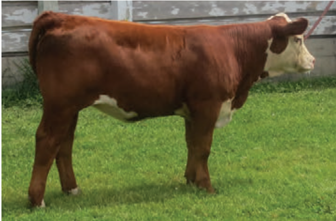
MHPH 68E NITA 203G

Although a two-year-old pair topped the sale, current year calves held the spotlight. Lot 1 brought $43,000.00. A ½ interest in MHPH 68E Nita 203G by ANL 420A Mountaineer 787X 68E was purchased by McDonald Farms, Grand Rapids, Michigan and her mother, MHPH 3134 Nita 1131E by Churchill Stud 3134A was purchased by Chula Vista Polled Herefords, Thornton, Ontario.