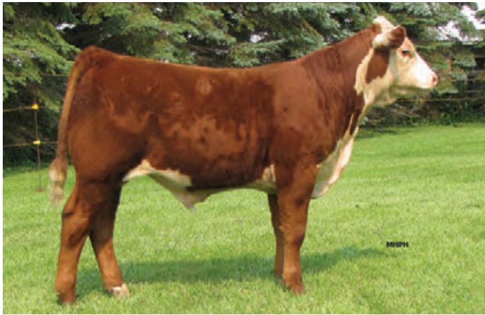
MHPH AFPH 10Y BOOMTOWN 319B

Topping the bull division was MHPH AFPH 10Y Boomtown 319B sired by NJW 73S W18 Hometown 10Y ET. Purchased by Taboo Polled Herefords, Nobleton, Ontario for $5,200.00, he later was awarded Junior Bull Calf Champion at the Royal Winter Fair in Toronto.