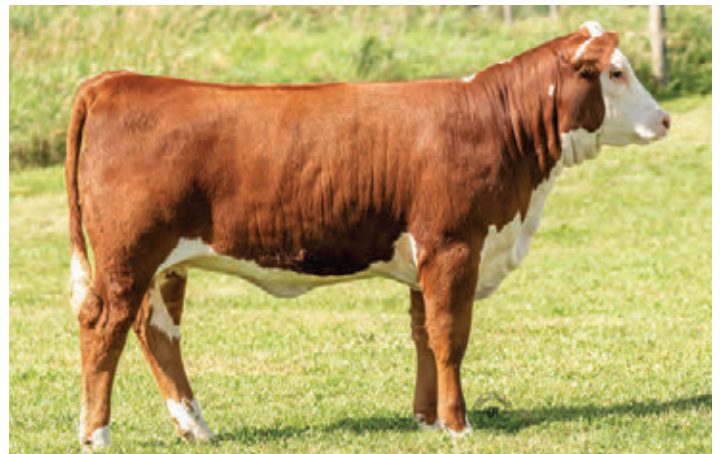
MHPH 117E LADY 106H

High selling heifer calf was MHPH 117E Lady 106H by MHPH 3134 Evolution 117E . Abby Hill Farms, Richmond, Ontario paid $21,000.00 for a ½ interest.