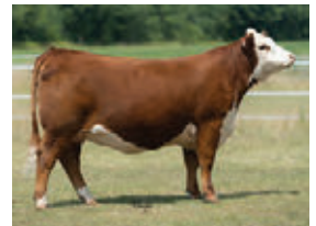
Nova- Maternal Sister