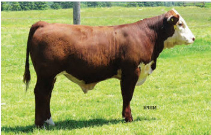
MHPH 3134 EVOLUTION 117E

High selling bull MHPH 3134 Evolution 117E sired by Churchill Stud 3134A at $54,000.00 for a ½ interest was purchased by Moorehaven Farms, Acton, Ontario and the Evolution Breeders Group. Later that fall, Evolution was named Senior Bull Calf Champion at the Canadian National and is now a Silver Trophy Sire.