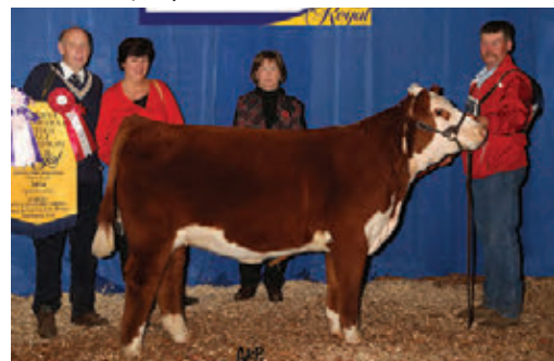
MHPH JWR 10Y SARAH 219B

A female topped the 2014 sale and went on to claim Reserve Grand Champion Female at the Toronto Royal Winter Fair. MHPH JWR 10Y Sarah 219B sired by NJW 73S W18 Hometown 10Y ET was purchased by Arthur Polled Herefords, Alida, Saskatchewan for $30,000.00.