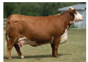
Shady-Lane Hannah 323E- Dam

Here's an opportunity to get in on an absolute power female that's loaded with style. Ada is a natural calf out of our donor female, Shadylane Hannah and for just a March baby she's already sporting that big hip, high volume cowy look that her mamma has with a showing presence.