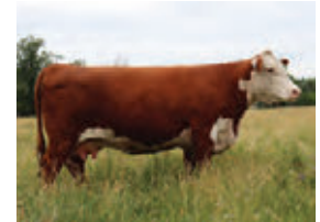
Delhawk E'Claire 98A ET - Dam

314K will be entered at the Royal and we would be happy to assist her new owner if they so chose.